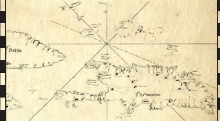
CHART YOUR COURSE FOR CROSSLINK INTERNATIONAL'S BAND AID BALL